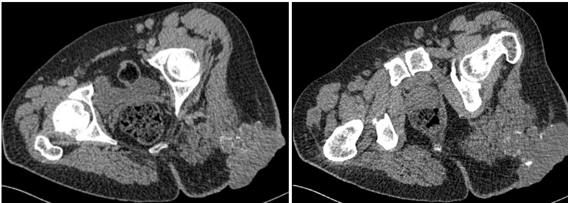
Figure 3: CT axial slices without and with contrast injection

Tissue tumor process is situated above the fascia in the subcutaneous soft tissue of the left gluteal region. It is fairly well circumscribed with irregular borders, isodense on spontaneous contrast, heterogeneous with calcifications, and contains some areas of necrosis. It is heterogeneously enhanced by the contrast medium, infiltrating posteriorly into the ipsilateral gluteus maximus muscle and the skin layer.