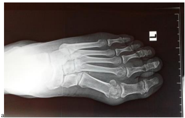
Figure 6: X-ray of the left foot showing signs of joint destruction associated with signs of left constructions in a 59-year-old adult with gout at the rheumatology department of the Aristide Ledantec Hospital in Dakar, Sénégal