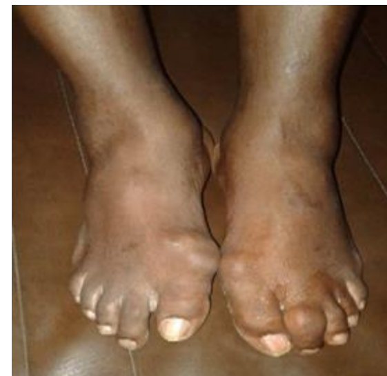
Figure 4: Tophi over the PPI of the left 2nd toe and over MTPS of the big toes in a 59-year-old adult in the rheumatology big toes in a 59-year-old adult in the rheumatology department of Aristide Ledantec Hospital in Dakar, Sénégal