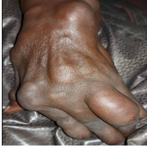
Figure 3: Tophi of the left hand and wrist in a 59-year-old adult with gout at the rheumatology department of Aristide Ledantec Hospital in Dakar, Sénégal

Figure 2: Tophi in the right auricular pinna of a 59-yearold adult with gout in the rheumatology department of Aristide Ledantec Hospital in Dakar, Sénégal