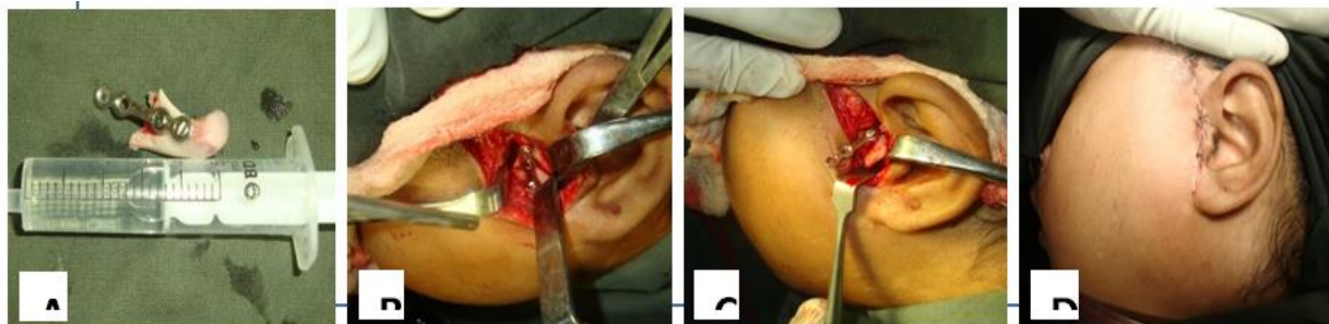
Fig-4: [a]: extracorporeal fixation of proximal segment with 4 holed miniplate [b]: repositioning the Proximal stump into the glenoid fossa [c]: fixation of proximal segment to the ramus [d]: wound closure