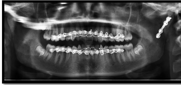
Fig-5: Immediate post op OPG showing fixation of fractured segment