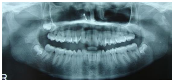
Fig-1: Pre-operative OPG showing left high condylar fracture

A 13-year-old female patient reported to our department with a chief complaint of pain in the left side of jaw. Intra-orally all teeth were present and the occlusion was deranged with posterior open bite on right side and no midline deviation was noticed. Mild restriction of mouth opening was noticed. On palpation Temporomandibular joint (TMJ) area was severely painful on the left side. OPG shows left condylar neck fracture [Fig-1]. CT showed anteromedial dislocation of the fractured neck of the left condyle [Fig-2].