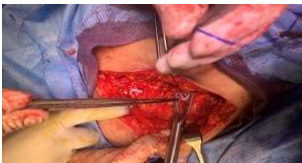
Fig-10: Both ends of the prolene fixed with Hemolok clips over the rectus sheath