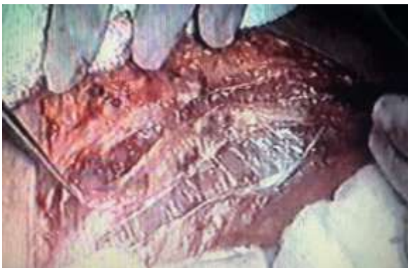
Fig-2: Rectus sheath sling marked out ( 10 cms* 2 cms)