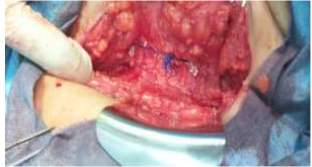
Fig-11: Final outcome of Hemolok clips over Rectus Sheath, prolene ends tightened loosely before wound closure