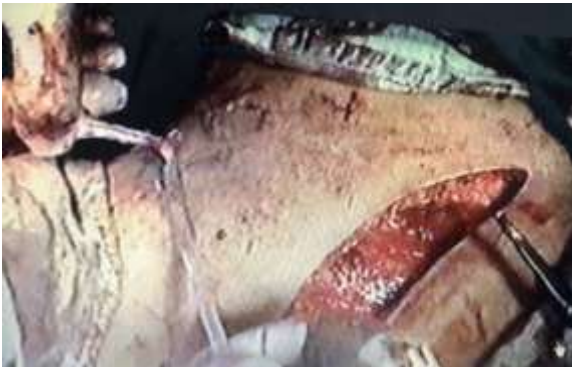
Fig-7: Rectus fascial sling passed one either sides from below to abdominal area