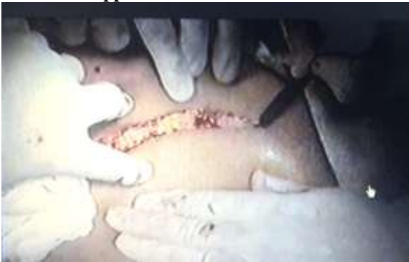
Fig-1: Abdominal incision just 2 cms above pubic symphysis