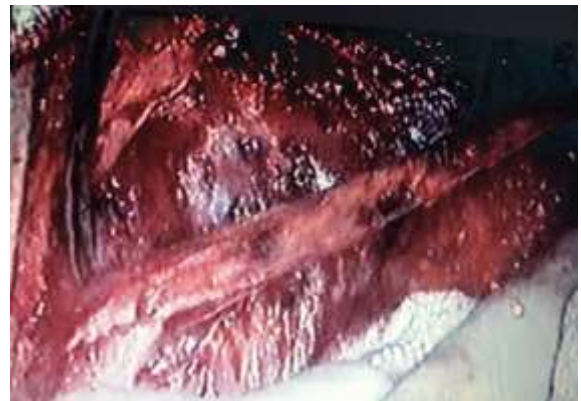
Fig-3: Rectus sheath isolated