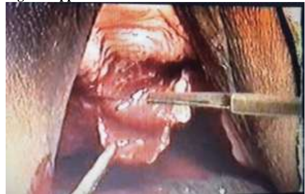
Fig-5: Midline/ inverted C incision at mid urethral area