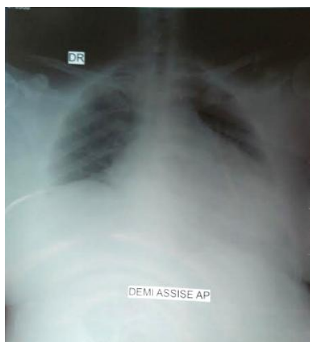
Fig-1: Chest X-ray revealed prominent cardiomegaly with increased pulmonary vascularity on both lung fields

Nine days after admission to the ICU, she was transferred to a normal ward. Throughout the further hospital stay, her clinical condition improved rapidly. She was discharged with standard replacement doses of hydrocortisone.