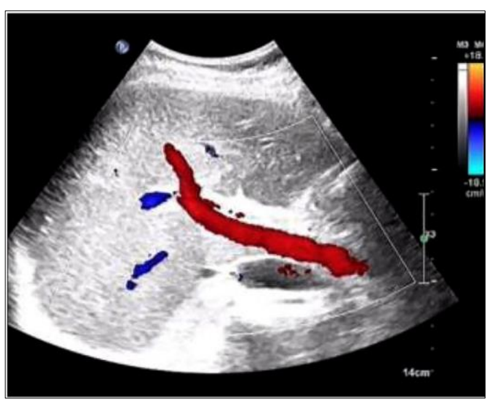
Figure 1: Liver ultrasound of the parturient in the emergency department. The size and shape of the liver were normal, the liver surface was smooth, and the liver margin was sharp, which indicated that there was no subcapsular liver hematoma upon admission

The patient underwent an abdominal ultrasound that showed no abnormalities ( Figure 1 ).