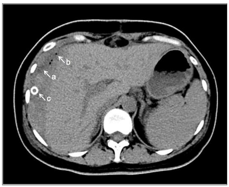
Figure 2: Computed tomography (CT) scan of the parturient on postpartum day 7. Subcapsular hematoma on the surface of the right lobe of the liver. a: Subcapsular hematoma of the liver; b: Abdominal gas accumulation; c: Abdominal drainage tube