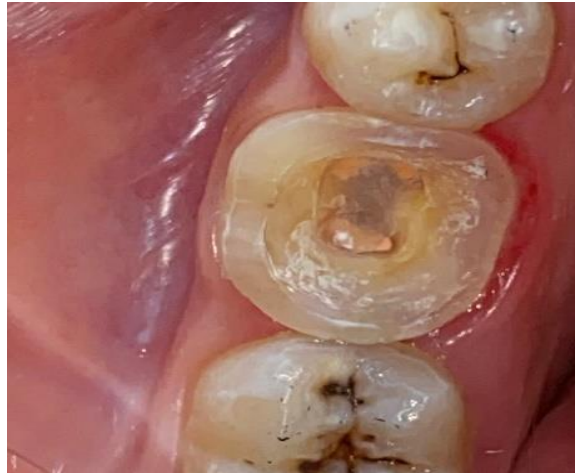
Figure 4: final preparation

An impression was performed using polyvinyl siloxane with the putty-wash technique and sent to the laboratory for prosthesis fabrication. In the meantime, a provisional restoration was created from acrylic resin and luted with temporary cement.