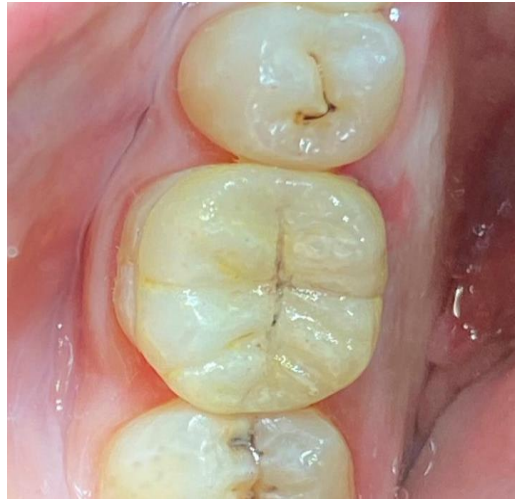
Figure 16: Final cementation