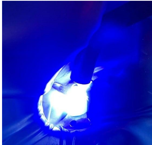
Figure 14: Light-curing the bonding agent