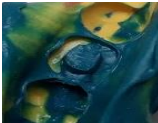
Figure 6: Impression made with polyvinyl siloxane material.