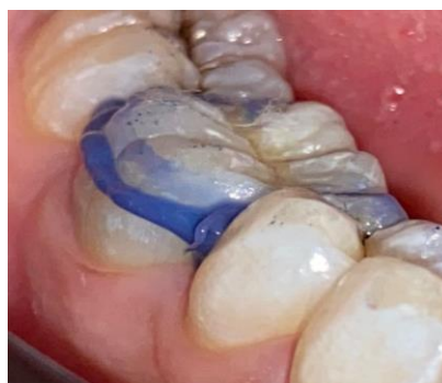
Figure 9: Try-in of the adaptation

After that a coupling agent, a silane, was applied for 1 minute and dried, to create a chemical bond between the composite resin and the inorganic glass matrices.