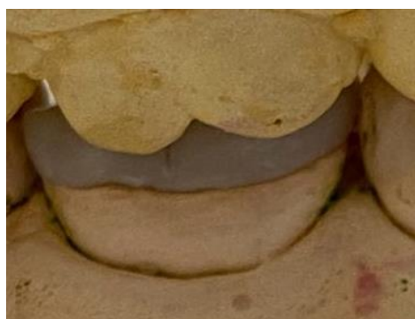
Figure 8: Fabricated endocrown on cast

Then, the endocrown try-in was conducted to assess occlusion and make any necessary internal and proximal adjustments.