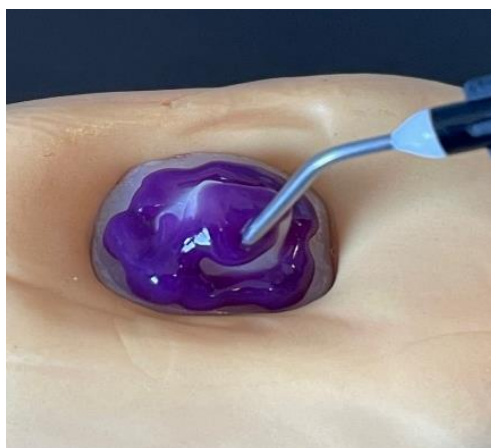
Figure 10: Etching the endocrown with hydrofluoric acid