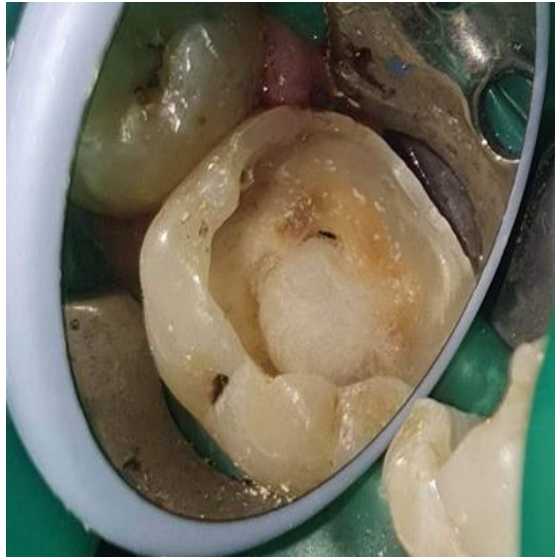
Figure 1: Pre-operative view of the endodontically treated molar