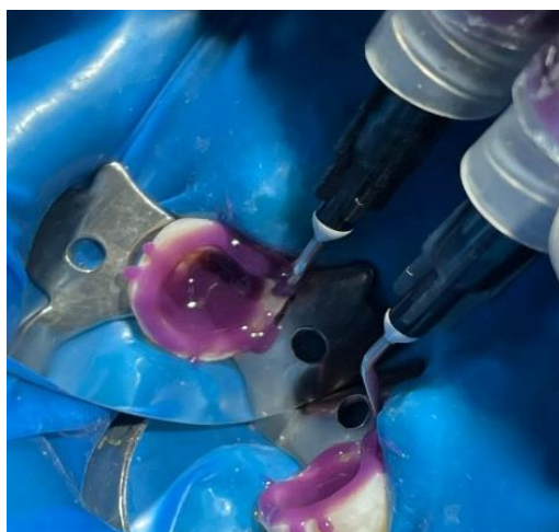
Figure 12: Acid-etching the tooth

Finally, a dual-cure resin luting cement was applied to the intaglio surface of the endocrown and adhesively bonded to the prepared tooth surface. Light curing was performed for 5 seconds to facilitate the removal of any excess cement, followed by a 60-second curing on all surfaces.