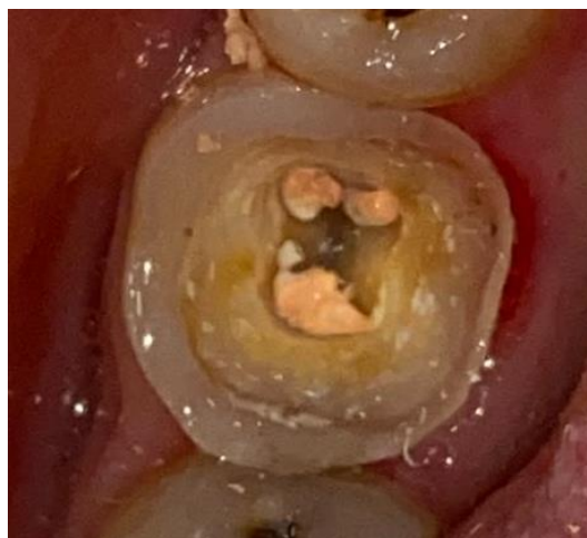
Figure 3: tooth preparation