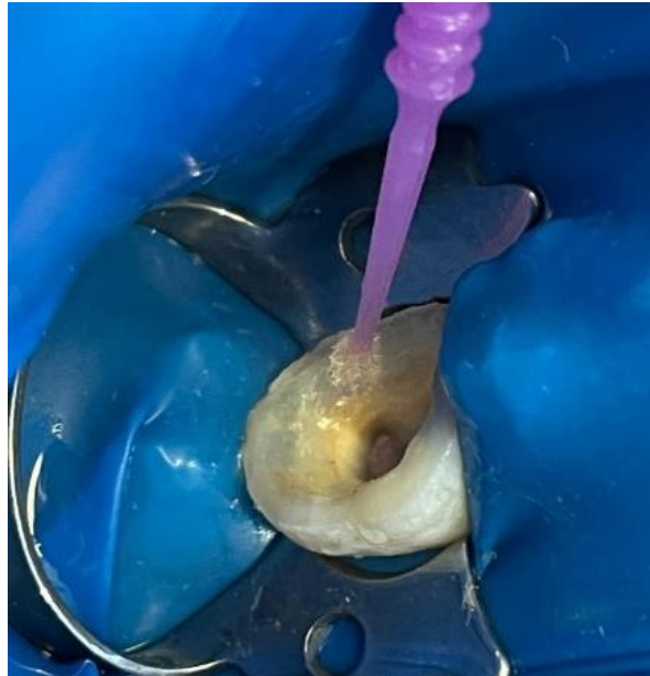
Figure 13: Application of the bonding agent