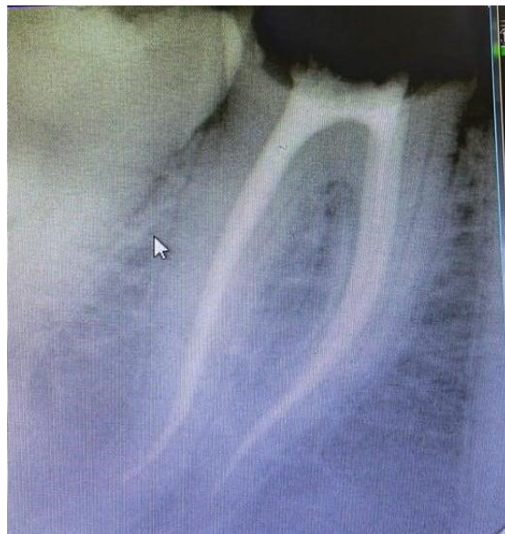
Figure 2: Preoperative intraoral periapical radiography