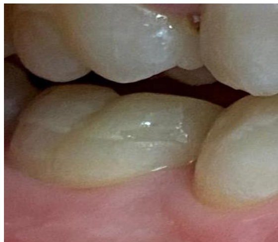
Figure 5: Temporary restoration