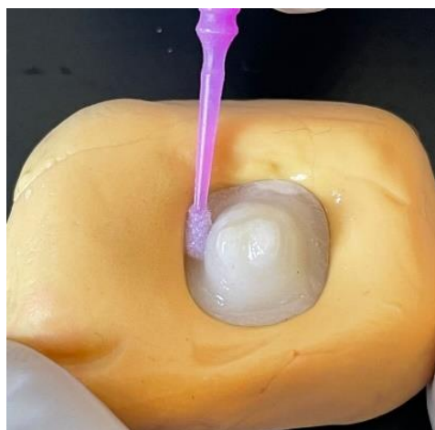
Figure 11: Application of silane coupling agent

Rubber dam isolation was performed on the prepared tooth surface, which was then etched with 37% phosphoric acid and applied for 15 seconds on the dentin and 30 seconds on the enamel. After thorough rinsing and drying, an adhesive was applied and polymerized with light curing for 20 seconds.