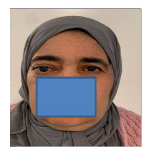
Figure 1 : Right orbital exophthalmos with periorbital swelling

Observation : A 61-year-old woman with hypertension presented with exophthalmos and right periorbital swelling for 1 year ( Figure 1 ).