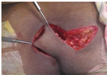
Figure 4: Flap Rotated on to the Defect to Achieve Tension-Free Closure.