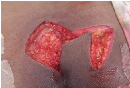
Figure 3: Preparation of a Right Gluteal Fascio-Cutaneous Limberg Flap Ready for Transposition.