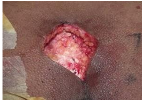
Figure 2: Excision of the Rhomboid Down to the Post-Sacral Fascia, Showing Intraoperative Exposure of the Defect.