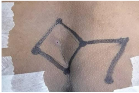
Figure 1: Rhomboid Marking Including Pilonidal Sinus and Planned Flap Extent Prior to Excision.