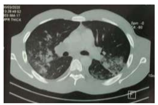
A: A parenchymal cut of a thoracic scanner, objecting to nodular bilateral opacities sometimes excavated

A PCR test for Sars-CoV-2 is performed in our patient at j9 and j10 returning negative, thus declaring the patient cured of COVID-19. After leaving the hospital, the patient is referred to the Center for Diagnosis of Tuberculosis and Respiratory Diseases (CDTMR) for additional therapeutic management of his tuberculosis.