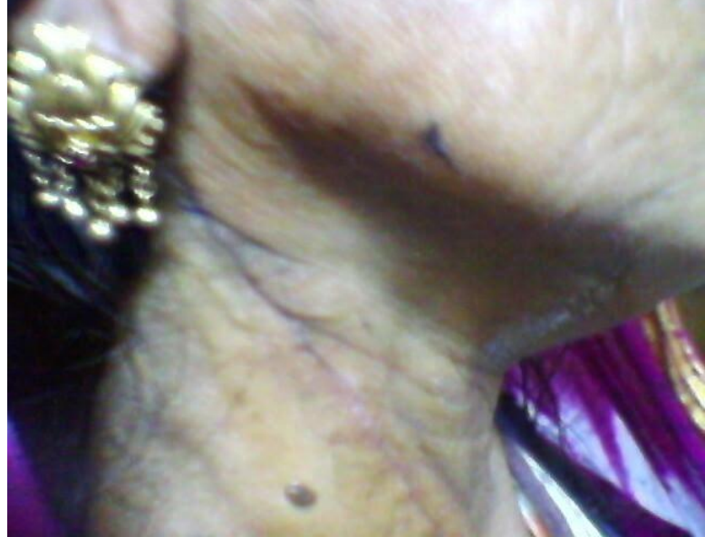
Fig-5: Intraoperative view: final result