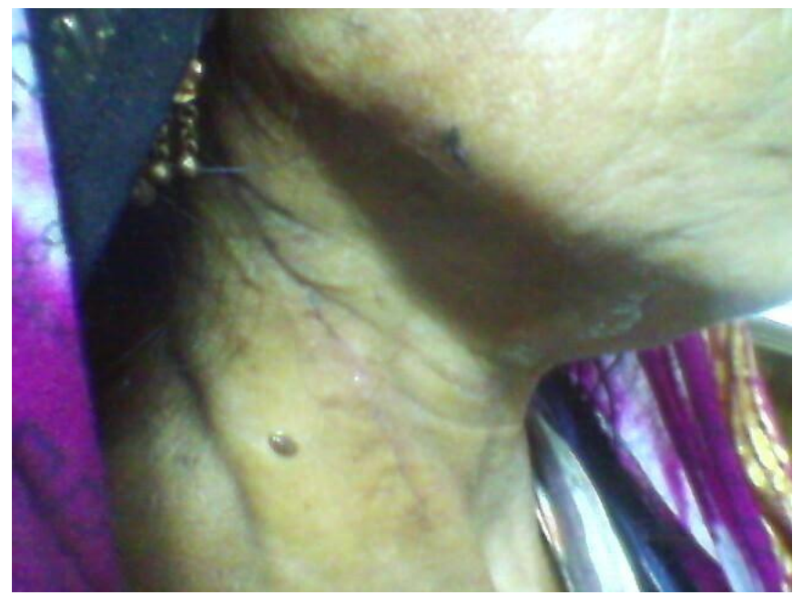
Fig-4: Intraoperative view: aneurismectomy with Dacron- patch closure

wall, preserving the lumen of the native artery, thereby reducing the risk of injury to the vagal, recurrent laryngeal and glossopharyngeal cranial nerves (Fig 4 & 5). No adverse neurological events (focal or non-focal) were intra or perioperatively observed; pathologic examination of the aneurysmatic carotid wall revealed severe complicated atherosclerotic lesions. The patient was hospitalised for 4 days and dis- charged with antiplatelet therapy. One month, 6 months and 1 year Duplex Scan follow-ups were performed which showed patency of the carotid axis with regular blood flow. The patient appeared asymptomatic.