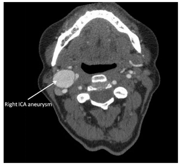
Fig-1: Angio-CT Scan: lateral view of the right carotid axis

and neck com- puted tomography: angio-CT scan revealed a wide- necked, saccular, "diverticulum-like" aneurysm at the origin of the right ICA, developing from the side of the carotid wall with a diverticular shape, with a lon- gitudinal diameter of 15 mm and transversal diameters of 14 mm x13 mm (Fig 1 & 2); in addition, a small atherosclerotic, calcific plaque of the bulbar ICA without hemodynamic flow impairment was shown; the left carotid axis appeared free from with aneurysmatic lesions atherosclerotic, an bifurcation. nonstenotic plaque at the carotid No other aneurysms were identified in the cerebral circulation. Further preoperative angiographic investigation was deemed unnecessary.