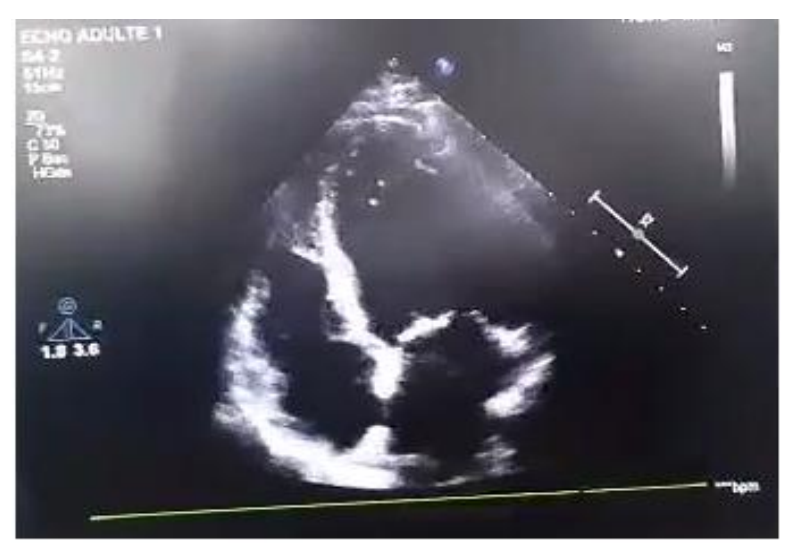
Fig-1: Transthoracic echocardiography (Apical4 cavities view)

An echocardiography after one week revealed restoration of left ventricular function and the patient was discharged.