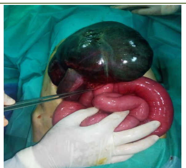
Figure 3: Operative appearance shows twisted and gangrenous terminal ileum and cecum