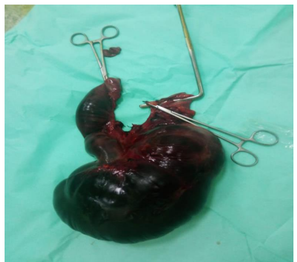
Figure 4: Operative appearance shows twisted and gangrenous terminal ileum and cecum