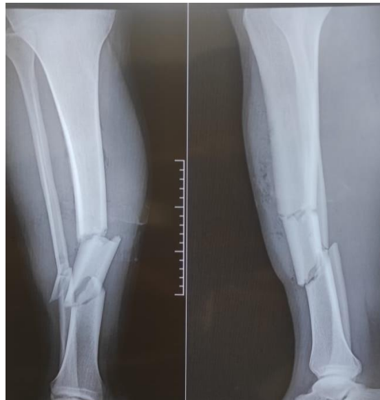
Fig-1: Anteroposterior and lateral leg X-ray at admission