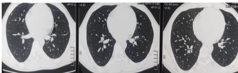
Fig-4: Radiological control (Computed Tomography Scan Thorax)