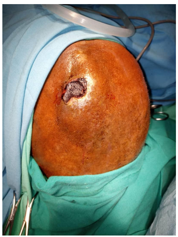
Fig-1: Pseudoaneurysm of Superficial Temporal Artery