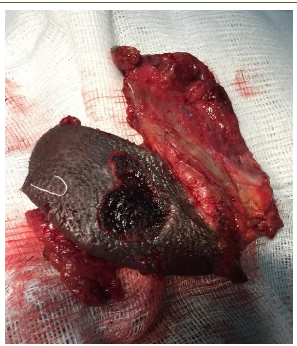
Fig-3: Excised Aneurysmal Sac

A diagnosis of pseudoaneurysm of a left superficial temporal artery with chronic subdural hematoma was made Excision of the pseudoaneurysm was done under general anaesthesia. Local infiltration with 1% Xylocaine with Adrenaline 1:200,000 was done around the anterior branch of the left superficial temporal artery and left supraorbital artery. The anterior branch was coagulated with bipolar diathermy and the supraorbital artery was ligated with Vicryl 3/0. The left subdural hematoma was evacuated through a burr hole placed on the cranium where the pseudoaneurysm was excised, while the hematoma on the right side was evacuated through a fresh scalp wound. Intraoperative findings were thickened wall of the sac with opening through the scab on the anterior wall and shining posterior wall that involved the pericranium (see Figure-3 above). Postoperatively the patient had an uneventful recovery. He was discharged on the tenth postoperative day. He was satisfied with the outcome of his surgery at the time of his first post-operative clinic visit (See Figure-4).