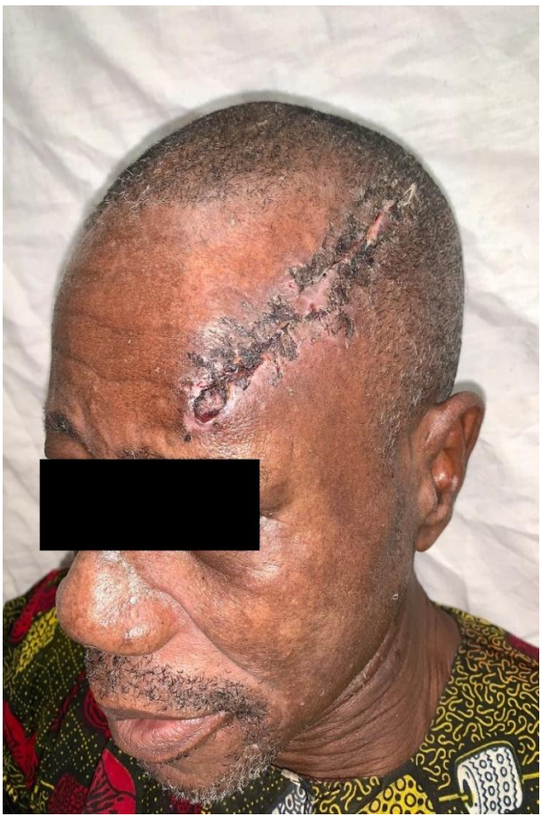
Fig-4: Post-operative outcome