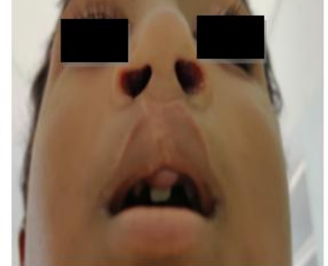
Post - op