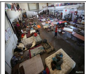
African and Haitian migrants intending to seek asylum in the U.S. rest on mattresses inside a shelter in Mexicali, Mexico, October 5, 2016.