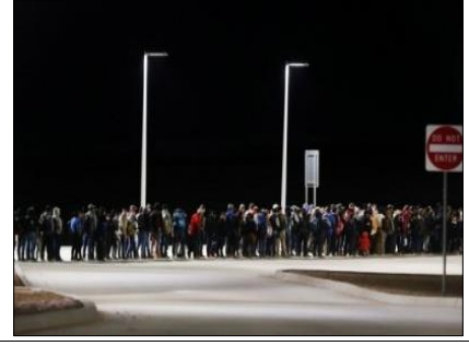
Source : CHANTAL DA SILVA, Why Are Hundreds of African Asylum Seekers Showing up at the U.S. Mexico Border? ON 6/7/19. Why Are Hundreds of African Asylum Seekers Showing up at the U.S...www.newsweek.com > border-patrol-surge-african-migrants-us.

The tortuous and uncertain journey of migrants from the Central American jungle to the United States, April 13, 2021. SOURCE: Eliott C. McLaughlin, "CNN: America's Legacy of Lynching isn't all History. Many say it's still happening today", June 3, 2020. Surveillance