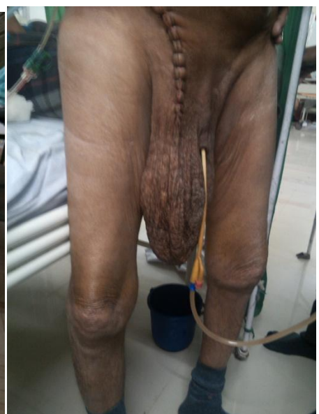
Fig. 2: Post-operative