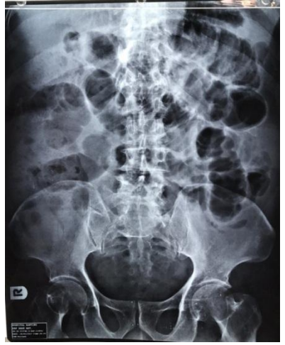
Fig-1: X-ray of Abdomen showing - Small bowel dilatation

A 68 years old male with no medical comorbids presented with abdominal distension associated with colicky abdominal pain and vomiting for two days. Hemodynamically he was stable with only mild dehydration. On clinical examination, his abdomen was distended with no signs of peritonism. Digital rectal examination was normal. His abdominal X-ray revealed small bowel dilatation (Figure 1) and his blood investigations were normal. In view of no previous history of abdominal surgery and X-ray abdomen showing small bowel dilatation, proceeded with CT abdomen (Figure 2). He underwent emergency diagnostic laparoscopy after adequate resuscitation. Intraoperatively, there was loop of small bowel in the supravesical fossa causing the intestinal obstruction. Herniated small bowel released from the sac via laparoscopic and the defect around 2 x 3cm was closed with non absorbable suture. The herniated small bowel appeared healthy after the reduction hence no resection was done. Post operative period was unremarkable and patient was discharged home after five days.