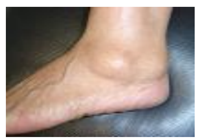
Fig-1: masse on the left ankle

The radiotherapy has proven good results as a postoperative treatment. In current treatment approaches, radiotherapy is recommended as an adjunct to total synovectomy for preventing recurrences in the presence of residual tumor or as second-stage treatment in recurrent cases. The synoviorthesis Isotopic with Yttrium 90 may be indicated in the extensive PVNS form. It was performed under radioscopic control. During the synoviorthesis, а corticosteroid (triamcinolone hexacetonide) was injected with the isotope [8, 11, 13]. Malignant transformation after radiation is a worrisome side effect, especially in young patients.