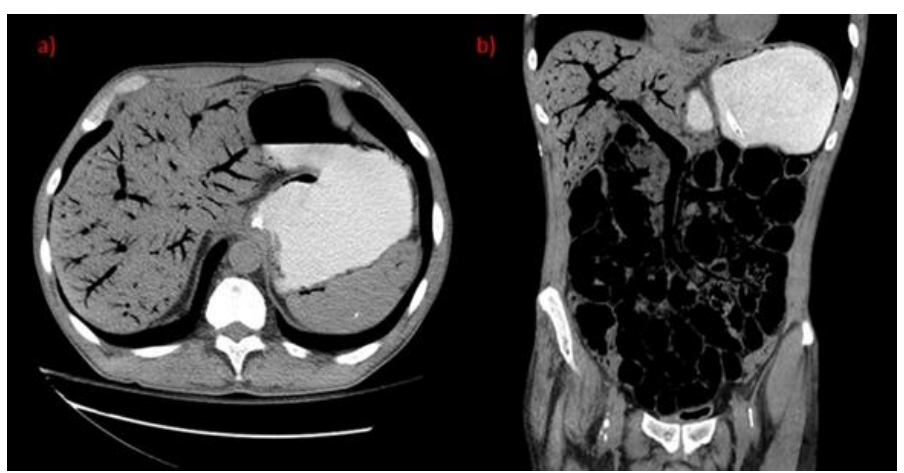
Fig-1: a)CT scan of the abdomen (axial cut) showing extensive intrahepatic portal venous air, air within the gastric wall b) CT scan of the abdomen (coronal cut) showing extra hepatic portal & mesenteric venous air and pneumatosis intestinalis