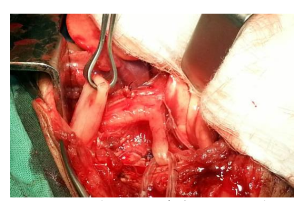
Fig-2: Proximal oesophageal pouch held with Babcock's forceps, and distal trachea-oesophageal fistula

lateral Thoracotomy and closure of fistula 38 days after presentation to prevent further soiling of the lungs and enable the neonate thrive. Laboratory investigations including Full blood count and electrolytes were within normal limits. Intraoperative findings were: dilated proximal oesophageal pouch (see Figure 2), a distal tracheoesophageal fistula just above the carina and a partial collapse of the lower lobe of the right lung.