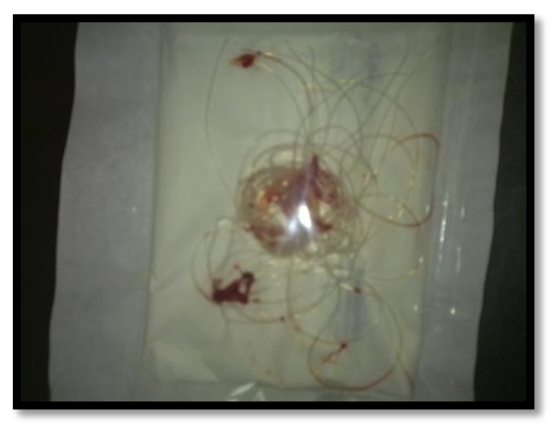
Fig-5: wire after removal