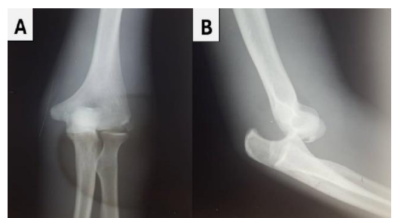
Figure 2: Preoperative anteroposterior (A) and lateral (B) radiographs showing the elbow dislocation

The preoperative radiographs confirmed a neglected posterior elbow dislocation.