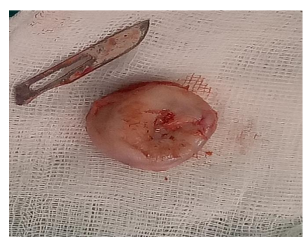
Figure 4: Peroperative image showing a hypertrophic radial head

A lateral approach of the elbow was done. Exploration revealed hypertrophy of the radial head, which justified a radial head resection (Figure 4).