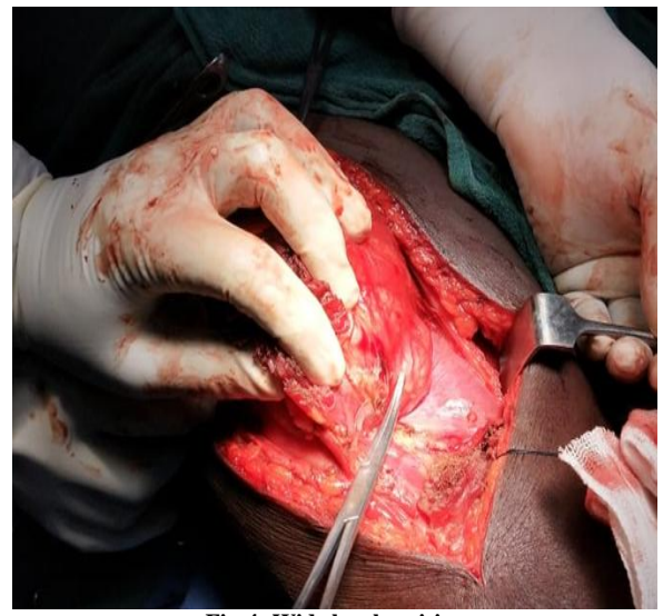
Fig-4: Wide local excision