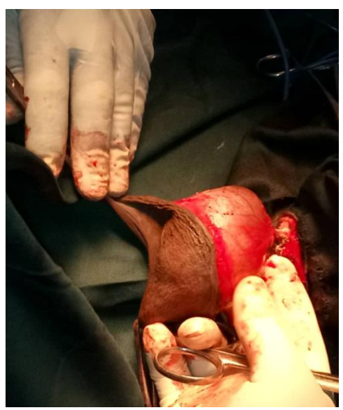
Fig-2: Dissection du kyste en per opératoire