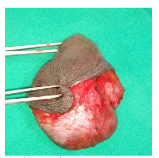
Fig-3: Dissection of the cyst during the operation