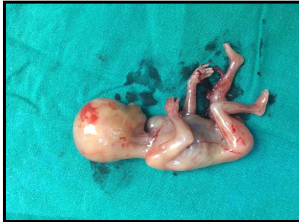
Fig-2: Showing well developed (14 weeks) fetus after removal from scar ectopic site