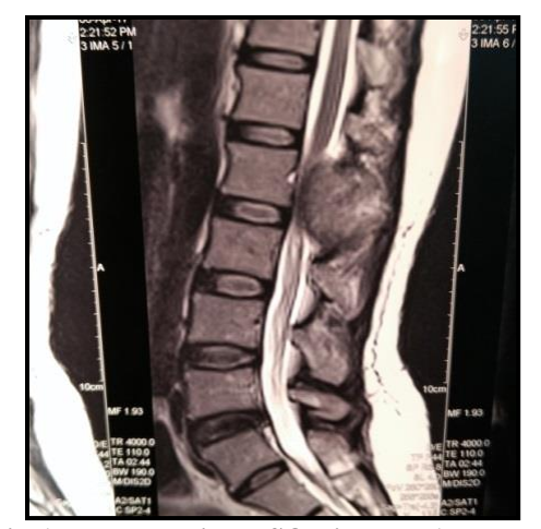
Fig-1: MRI showing a SOL in the L1 vertebra

Subsequently, tumoural excision was done and the mass was sent for histopathological examination. Histopathological findings were consistent with carcinoma, with features of metastatic follicular carcinoma of thyroid. The patient also underwent total thyroidectomy 45 days later, and the histopathological result was verified as follicular carcinoma of thyroid. The patient made an uneventful recovery and on further follow-up she was doing fine.