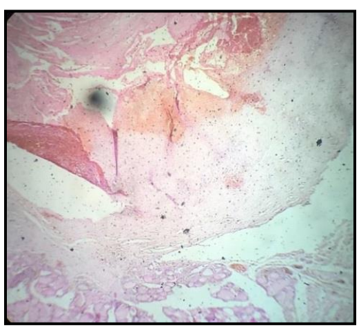
Fig-4: Histological picture of follicular carcinoma of thyroid