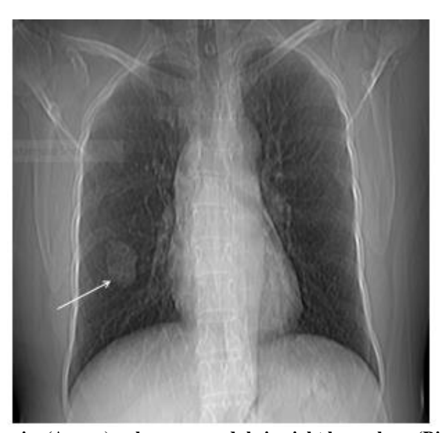
Fig-1: Chest radiograph showing(Arrow) pulmonary nodule in right lower lung (Biopsy showed Cryptococcus)

Lymphocyte was 85.5 to 96.5 ,Adenosine deaminase was 2.8U/L to 11.2U/L, cryptococcal antigen titre was 1:213dilution to 1:64dilution respectively in Cryptococcus to Cryptococcus + TBM group(Table-3). India ink was positive (Figure-3) in 80% patients, Cryptococcal antigen in 100% and 50% had grown Cryptococcus from CSF culture.