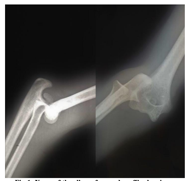
Fig-1: X-ray of the elbow, face and profile showing a postero-external dislocation of the elbow associated with a fracture of the epitrochlea

splint at 90 ° elbow flexion and pronation for four weeks. The evolution was marked by the stability of the elbow, consolidation of the fracture and the absence of nervous deficit.