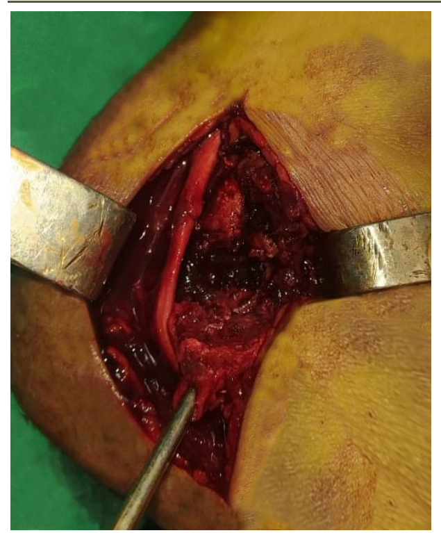
Fig-2: Intraoperative view showing the incarceration of the ulnar nerve