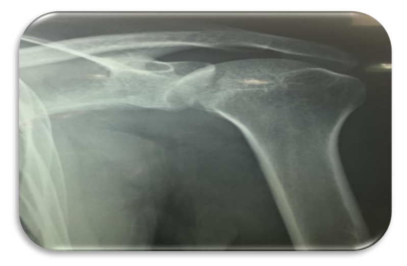
Fig-1: Radiographic appearance of posterior gleno-humeral dislocation

immobilized for 4 weeks, rehabilitation was performed for 2 months. Resumption of sport was authorized at 12 weeks post-trauma. From the first training session, and following an ordinary trauma; our patient represented acute pain in the left shoulder, the X-ray diagnosed a recurrent posterior dislocation of the shoulder (Fig-1). Computed tomography revealed a notch occupying 35% of the humeral head (Fig-2). A bloody reduction was performed with filling of the humeral notch by transposition of the trochin and subscapularis (Fig-3). At the last 12-month follow-up, there was no recurrence, with resumption of sport after a 12-week break.