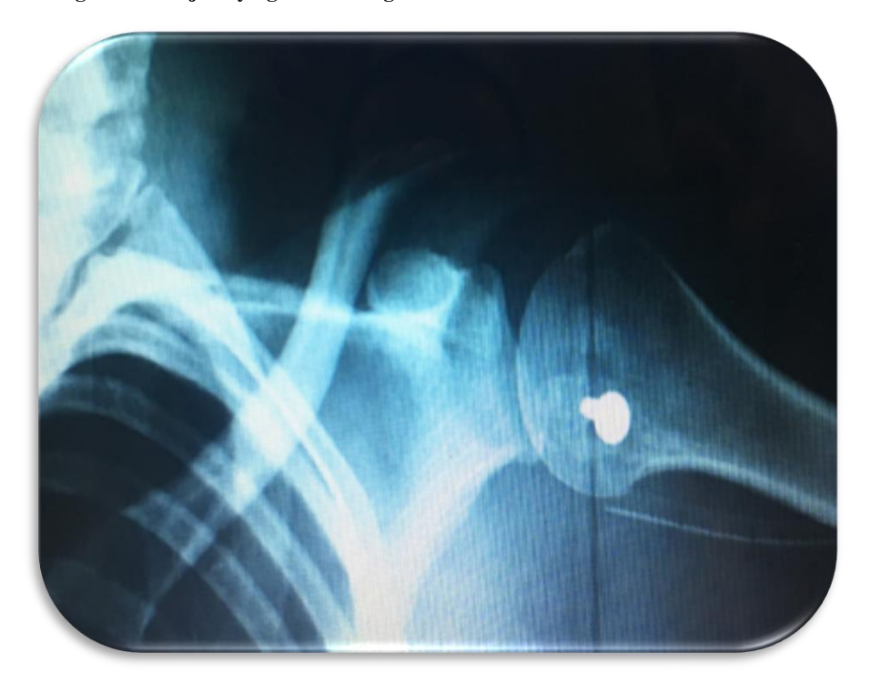
Fig-3: Radiographic control after trochin and subscapularis transposition