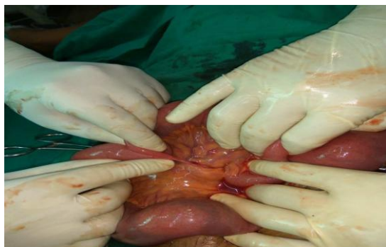
Fig-5: Omental Band Causing Obstruction