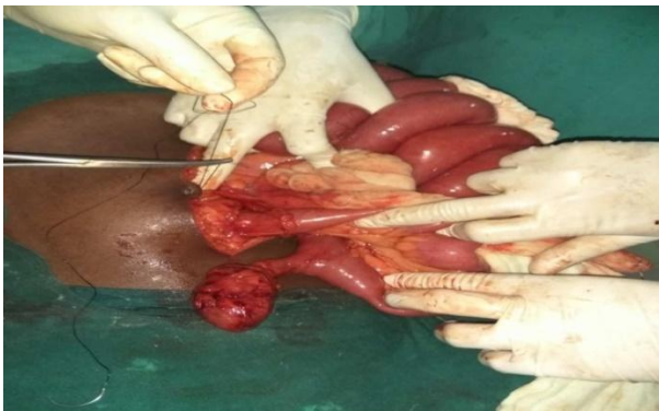
Fig-10: Meckel's Diverticulum

presenting as acute abdomen and requiring surgical intervention. 100 patients between 18 to 80 years of age admitted to the surgical wards with provisional diagnosis of intestinal obstruction were taken for this study.