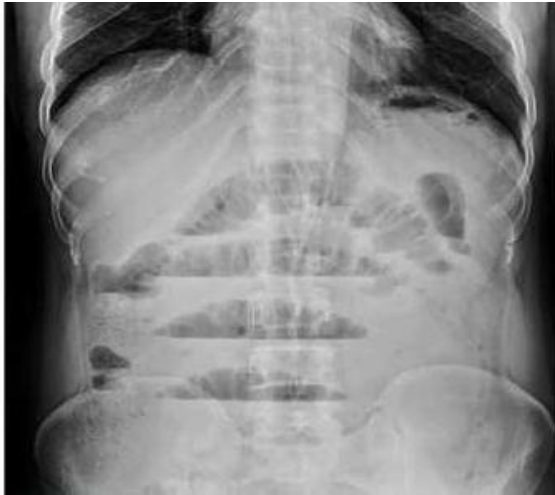
Fig-3: Erect X-Ray Abdomen Showing Multiple Air Fluid Levels