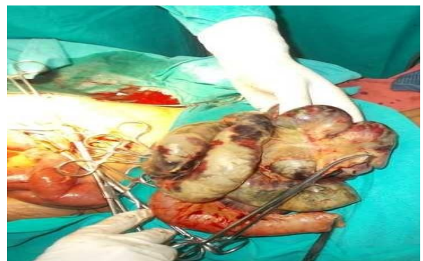
Fig-8: Gangrenous Small Bowel Secondary to Mesenteric Vascular Ischemia