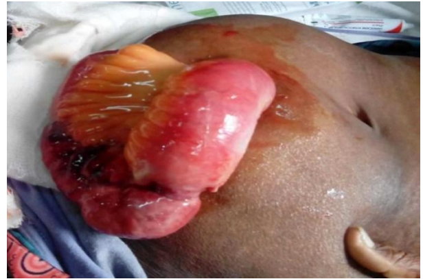
Fig-6: Spontaneously Ruptured Obstructed Incisional Hernia