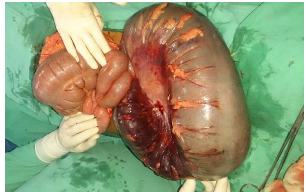
Fig-7: Gangrenous Sigmoid Volvulus