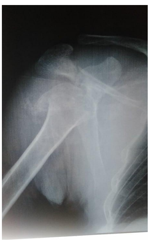
Fig-1: Rx of the right shoulder showing bone destruction affecting the humeral head and the glenoid

The patient was referred to the orthopedic surgery department, where he underwent prosthetic replacement with a cephalic shoulder prosthesis (Figure-3).