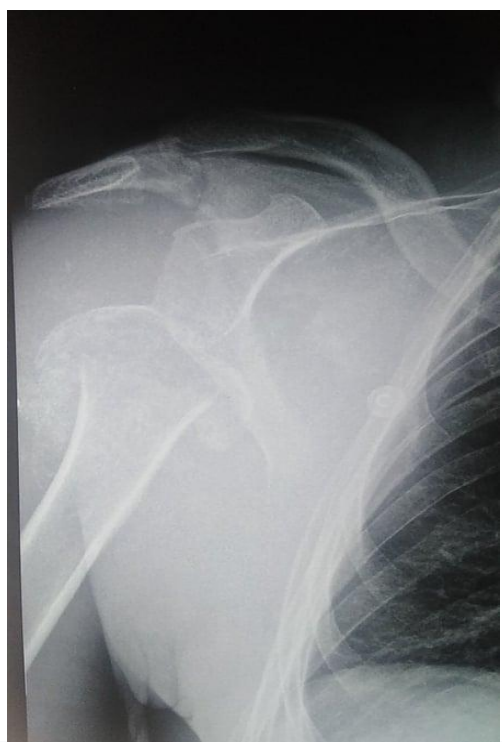
Fig-2: Rx of the same patient showing the extent of bone destruction