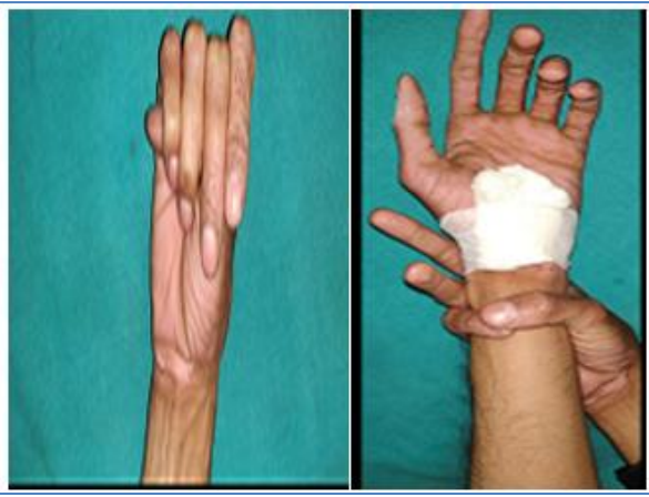
4mm punch biopsy was done from the hyperkeratotic lesion of the left palm that revealed orthokeratotic hyperkeratosis, hypergranulosis and