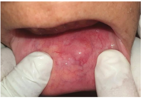
Fig-1: Clinical image of a mass of the lower lip

Clinical examination revealed a 1cm × 1 cm, dome shaped, palpable, soft-to-firm, well-demarcated mass on the left side of lower lip with normal overlaying mucosa (Figure 1). The patient had only noticed the swelling few weeks before consultation. Digital pressure did not evoke pain. No signs of dysesthesia were noted and no lymph nodes were palpable on the neck area.