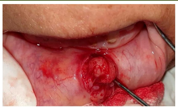
Fig-2: Intraoperative view of the lesion

Histopathological diagnosis was consistent with ACC of the MSG. The surgical margins were positive. Hence, the patient was referred to an Oral and