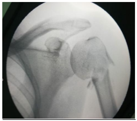
Fig-1(a): Anteroposterior view of left shoulder taken in C-arm showing displaced fracture of the surgical neck of humerus with varus angulation