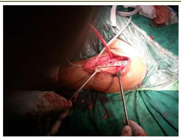
Fig-1(c): Intraoperative picture – Fracture reduced and PHILOS plating being done