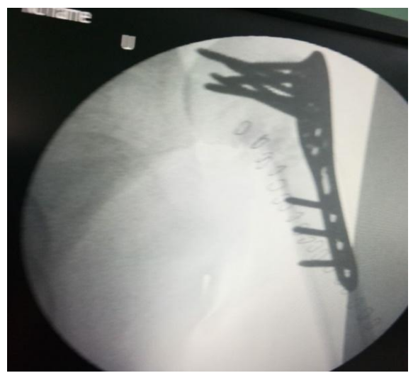
Fig-1(d): C-arm picture showing the reduced fracture fixed with the proximal humerus locking plate