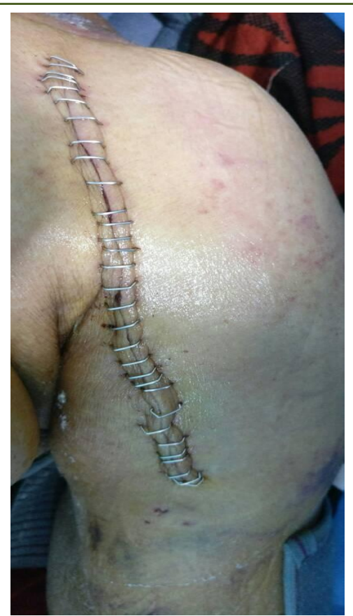
Fig-2(b): Postoperative picture of the patient after fracture reduction and PHILOS plate fixation and stapling of the operative wound