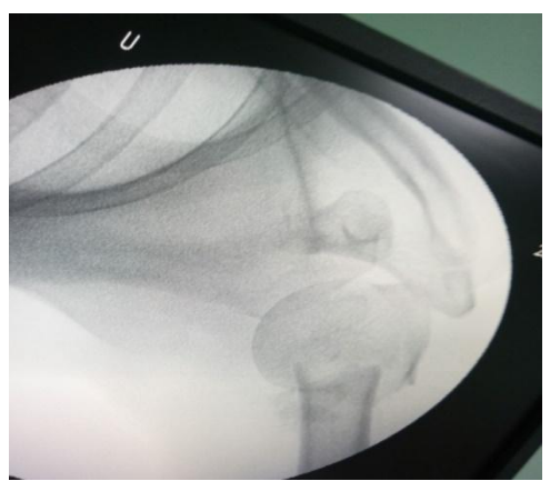
Fig-1(b): Axial view of the same patient taken on C-arm