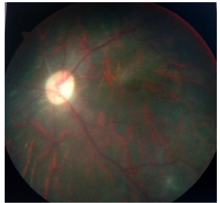
Fig-1: Color fundus photography of the left eye showing diffuse chorioretinal atrophy and absent foveal reflex with aspect of stellar macular degeneration

Ocular ultrasound (Figure-2) showed in the right eye, a thick hypereflective membrane with limited mobility evoking an old retinal detachment without intravitreal haemorrhage or visible tears. In the left eye, ultrasound showed a small localized and hyperechoic