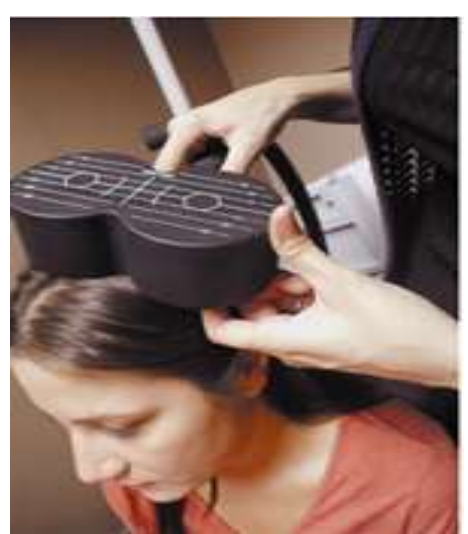
Fig-1: Eight shaped RTMS Device

specific brain cells suggests that rTMS therapy has an extremely valuable therapeutic potential and treatment can be customized for each patient.