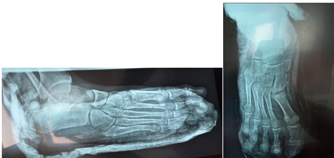
Fig. 3-4: Radiography of the foot after reduction and immobilization