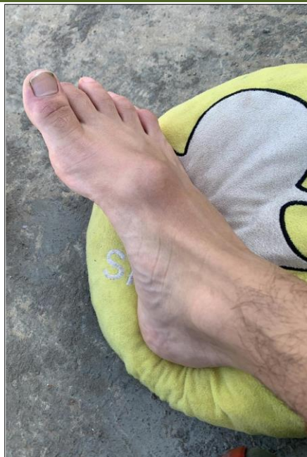
Fig. 1: Clinical image of our patient's foot upon arrival at the Emergency Department