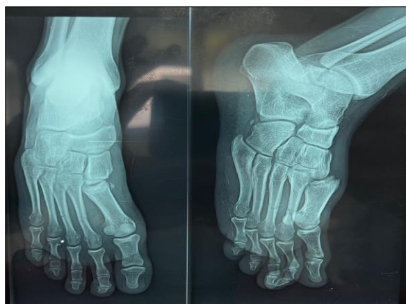
Fig. 2: Radiography of the right foot showing a dislocated M1C1 associated with a fracture of the 2nd and 3rd metatarsal