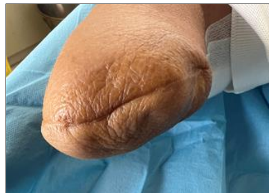
Figure 4: arm stump after 3 months

At one week post-amputation , the patient's inflammatory markers normalized, and his wound showed signs of healing. Hemodynamically, the patient stabilized and no further ischemic complications were noted.