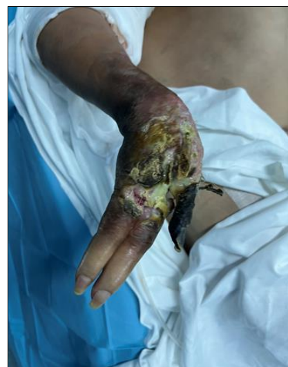
Figure 1: right hand with necrosis of the fingers

Upon evaluation, the right hand was hot, with necrosis of three distal fingers and absent distal pulses (Figure 1)