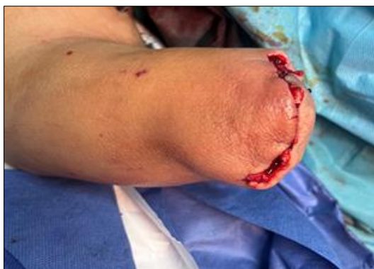
Figure 3: amputation of the right arm

At one month , the stump continued to heal well, and the patient reported improvement in pain levels. Physical examination revealed no signs of infection or recurrent ischemia.