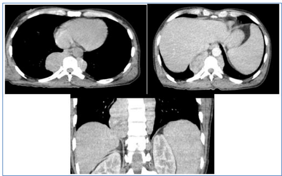
Figure a et b et c: Axial and coronal sections: showing a lesional process of the two costo-vertebral splints, well limited measuring 5x3.8 cm on the right and 3x2 cm on the left, heterogeneously enhanced hypodenses after injection of the PDC, without detectable bone lysis or endoductal extension.